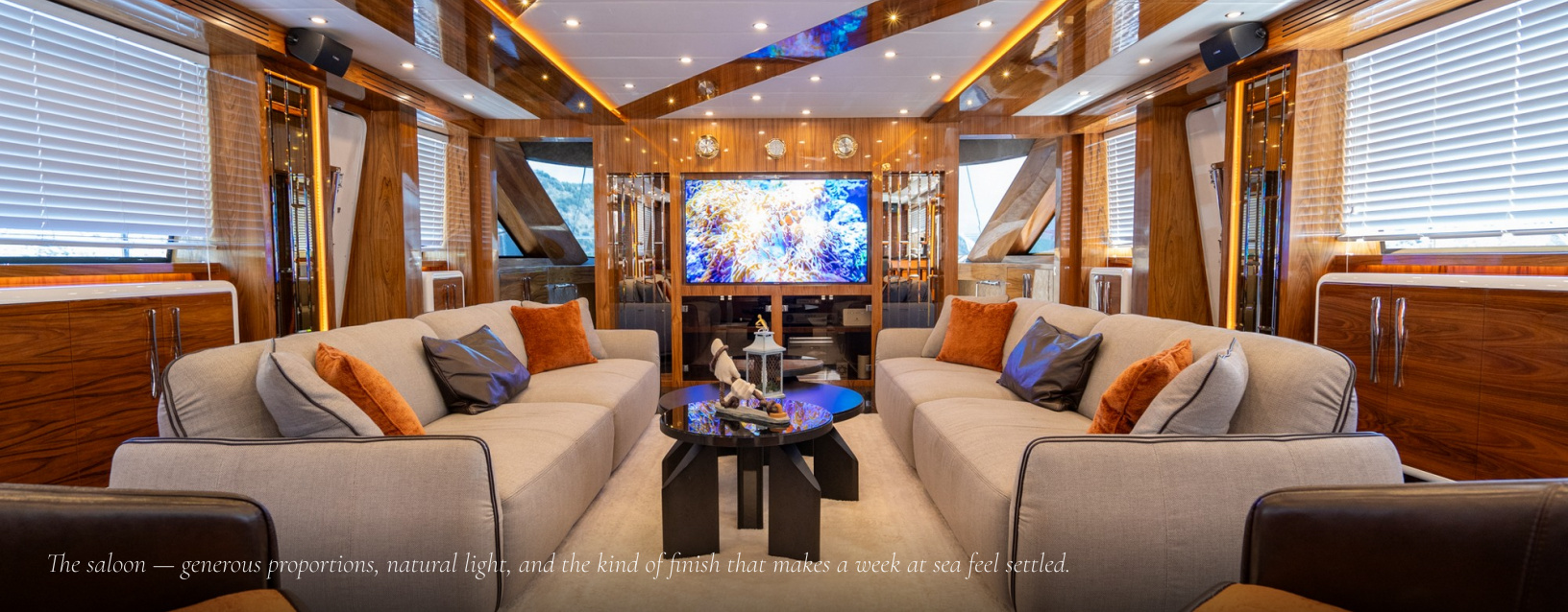
The saloon — generous proportions, natural light, and the kind of finish that makes a week at sea feel settled.