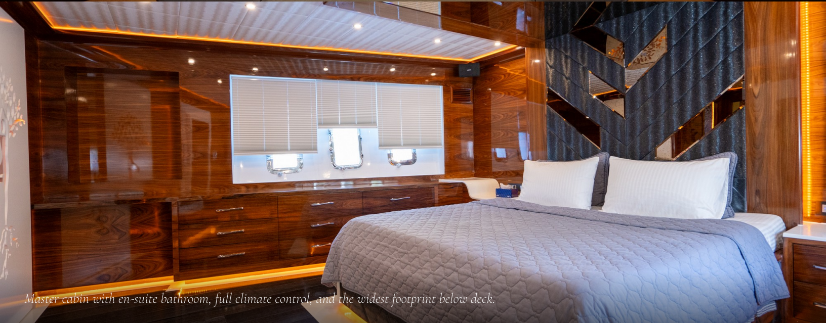
Master cabin with en-suite bathroom, full climate control, and the widest footprint below deck.