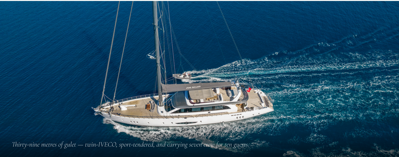
Thirty-nine metres of gulet — twin-IVECO, sport-tendered, and carrying seven crew for ten guests.

Twin 650 HP IVECOs give her the range to cover the Turkish coast without fuel stops dictating the schedule. Bodrum to Göcek, Fethiye to the Gulf of Hisarönü — she knows these waters well.