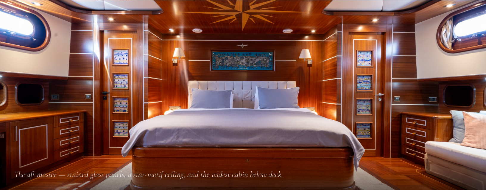
The aft master — stained glass panels, a star-motif ceiling, and the widest cabin below deck.