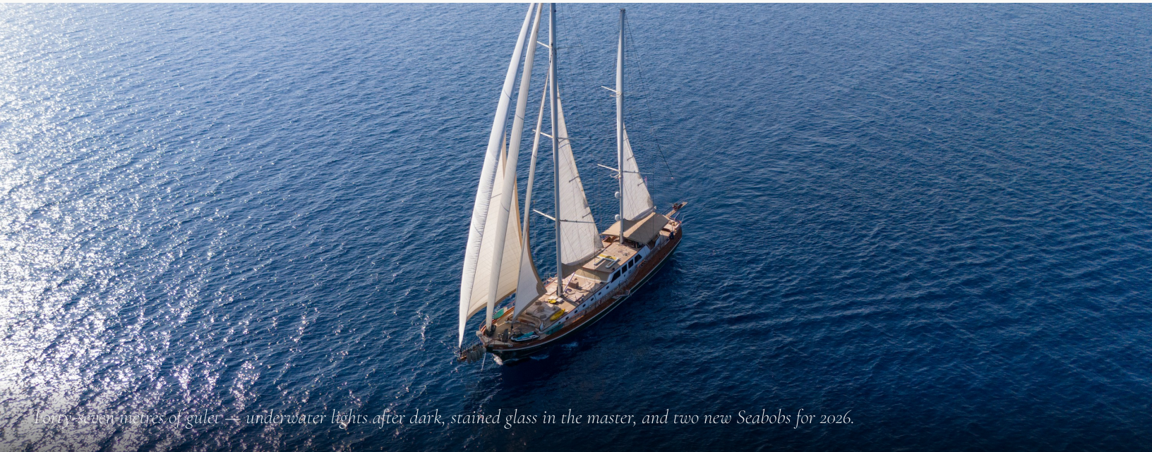
Forty-seven metres of gulet — underwater lights after dark, stained glass in the master, and two new Seabobs for 2026.

For 2026, two new Seabobs join the toy list alongside a jet ski, wakeboard, water ski, SUP, kayak, Big Mable, and ringo. The 5-metre tender (115 HP) handles shore runs and exploration.