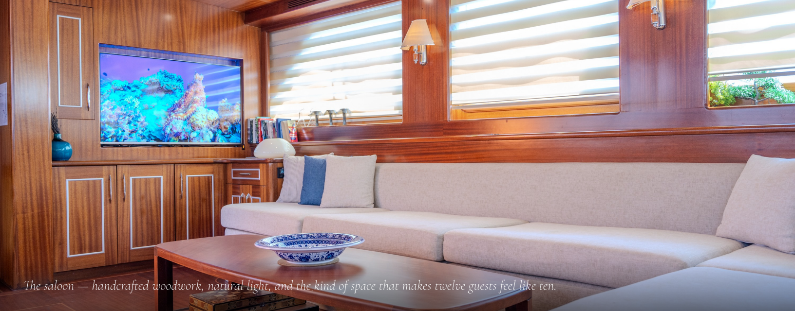
The saloon — handcrafted woodwork, natural light, and the kind of space that makes twelve guests feel like ten.