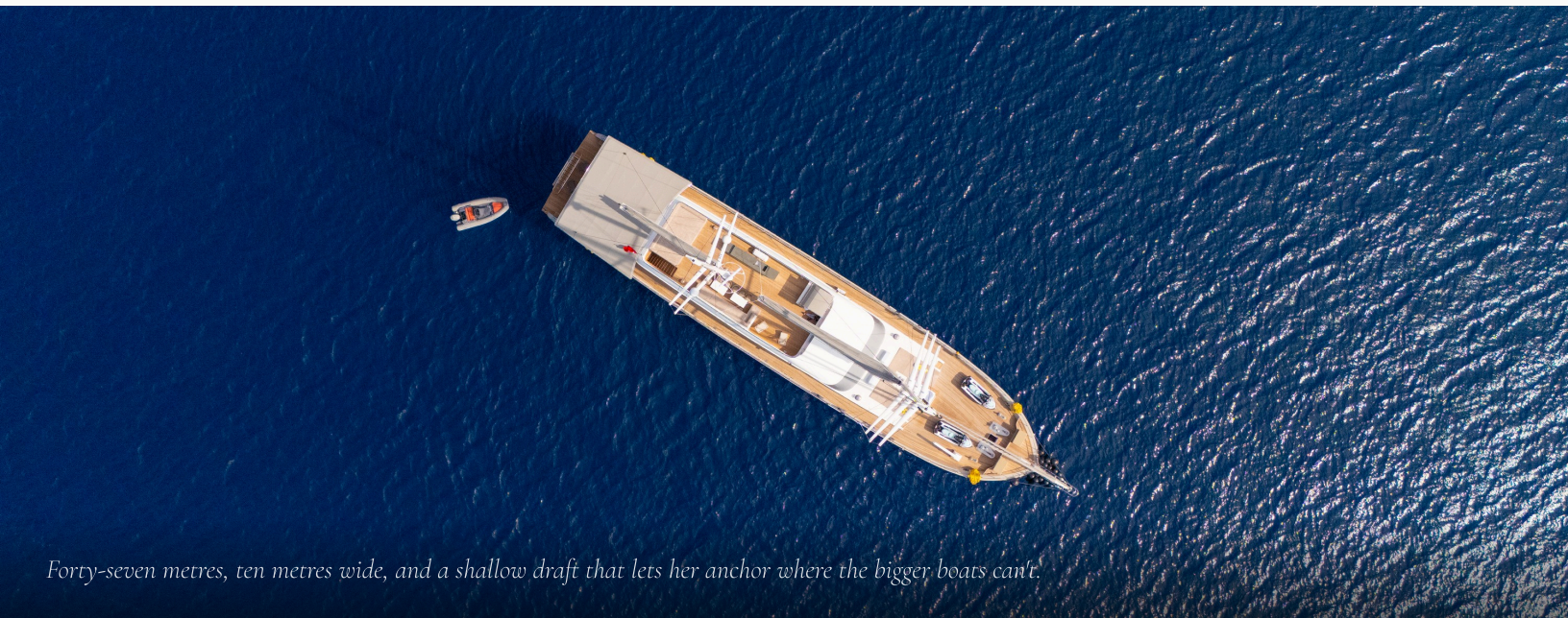
Forty-seven metres, ten metres wide, and a shallow draft that lets her anchor where the bigger boats can't.

The toy list matches the scale: a 6-metre Northstar tender (150 HP), a 4.8-metre support tender, two Seadoo jet skis, two Seabobs, two sets of water skis and wakeboards, SUPs, kayaks, and a four-seat Big Mable. The flybridge adds a second living area with its own bar and lounge.