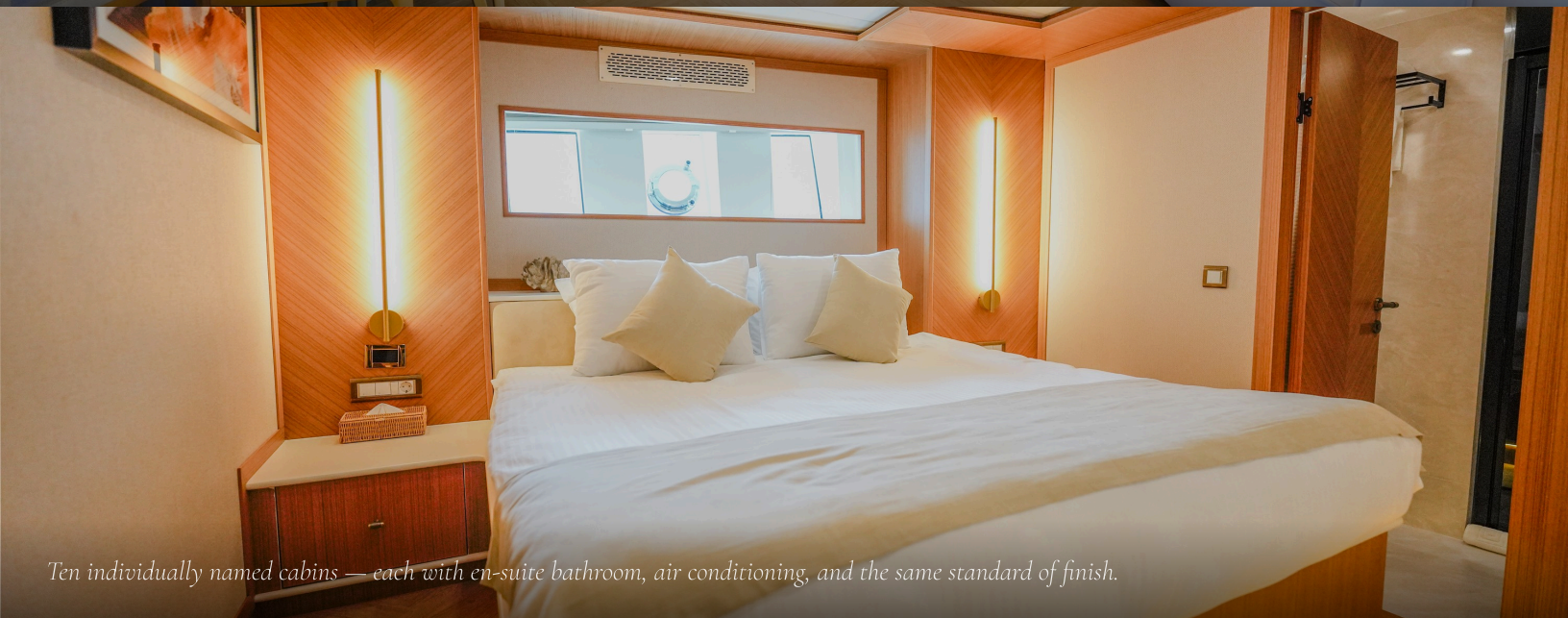
Ten individually named cabins — each with en-suite bathroom, air conditioning, and the same standard of finish.