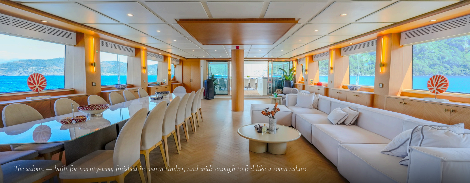
The saloon — built for twenty-two, finished in warm timber, and wide enough to feel like a room ashore.