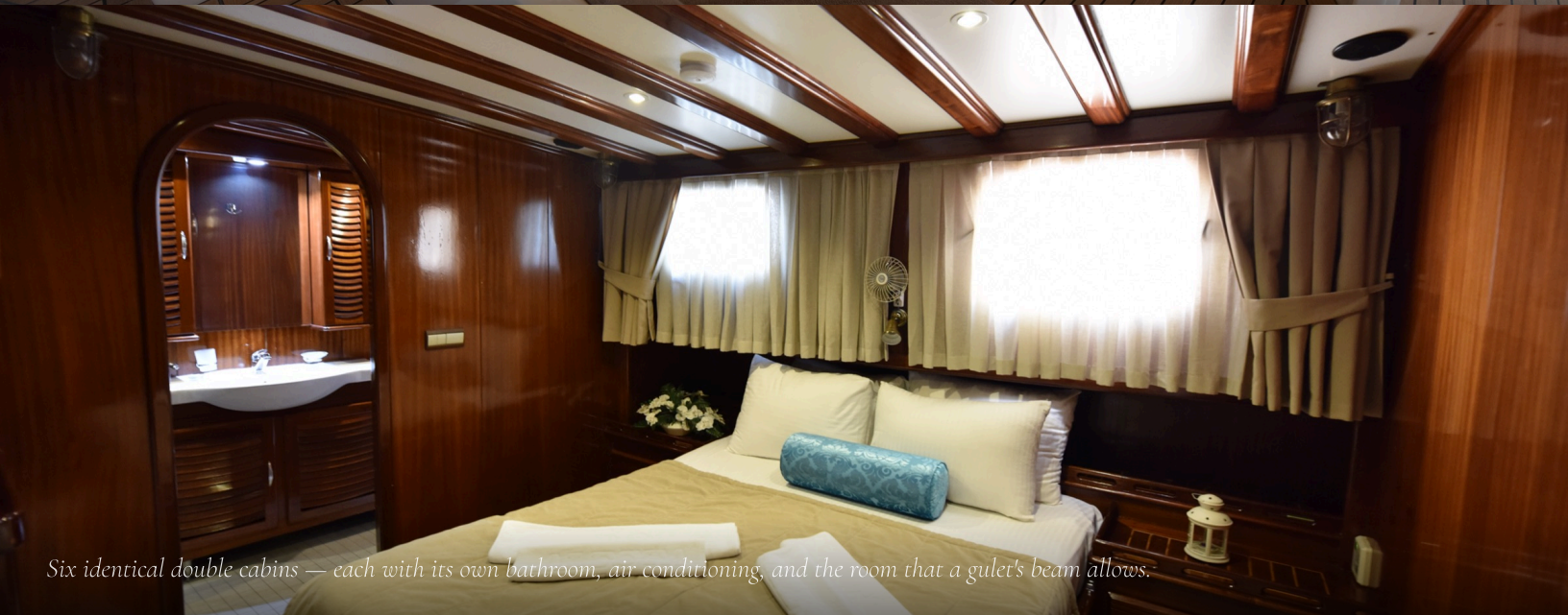
Six identical double cabins — each with its own bathroom, air conditioning, and the room that a gulet's beam allows.