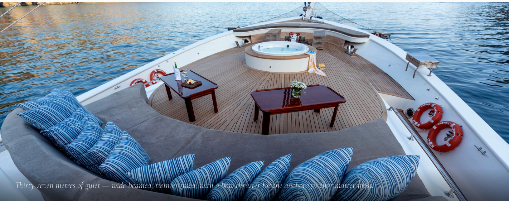
Thirty-seven metres of gulet — wide-beamed, twin-engined, with a bow thruster for the anchorages that matter most.

A crew of five runs everything: cooking, navigating, anchoring, and keeping the teak deck and timber saloon in the kind of condition that makes the boat feel cared for rather than just maintained. Twin 450 HP IVECO engines and 90 KWA of generator power keep things running quietly in the background.