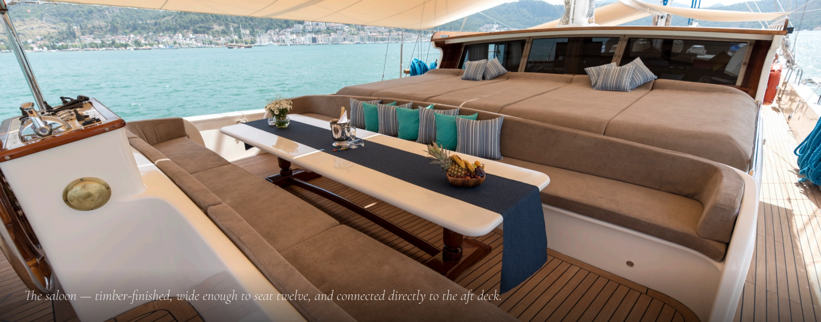
The saloon — timber-finished, wide enough to seat twelve, and connected directly to the aft deck.