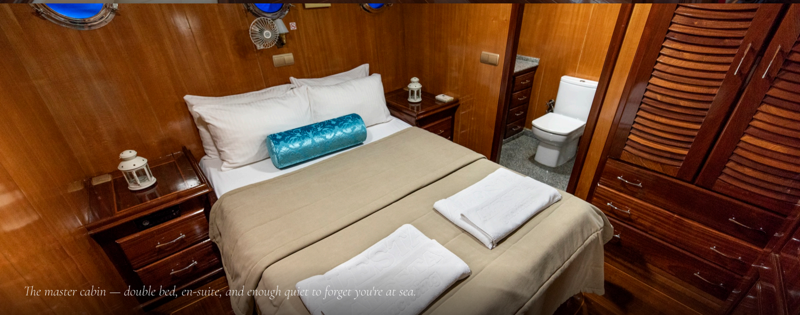
The master cabin — double bed, en-suite, and enough quiet to forget you're at sea.