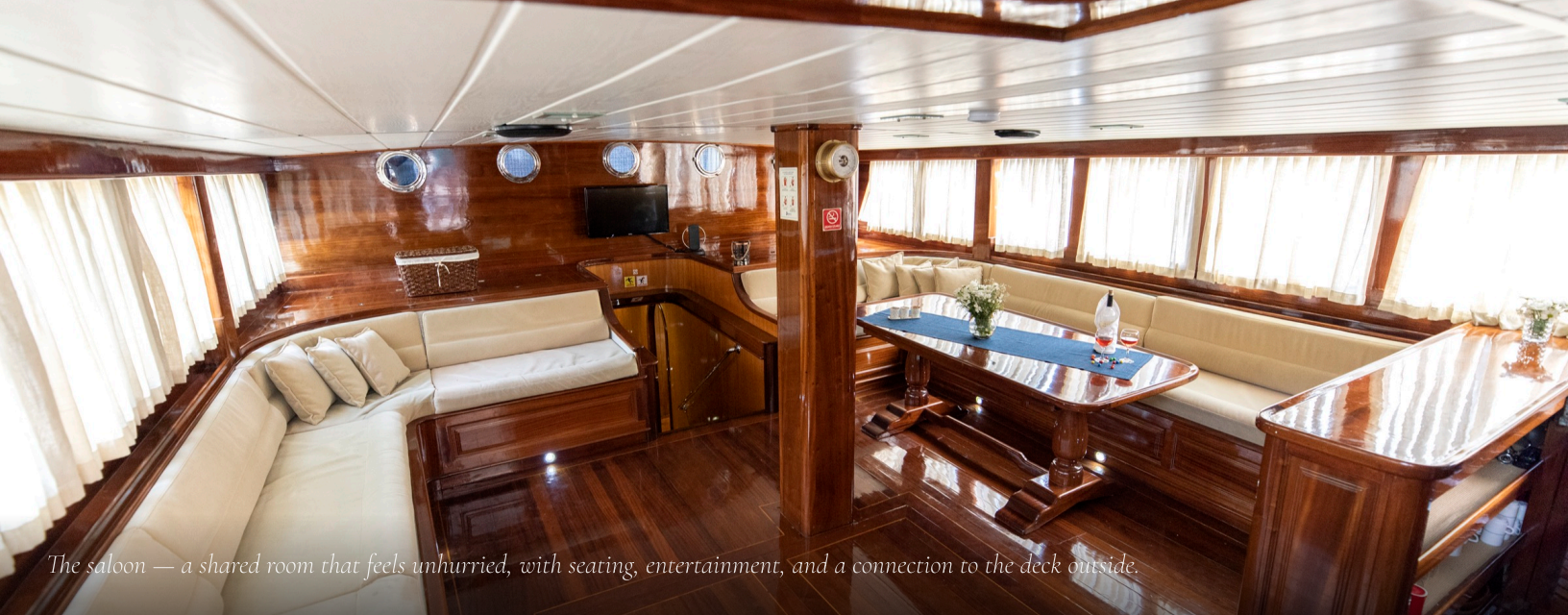
The saloon — a shared room that feels unhurried, with seating, entertainment, and a connection to the deck outside.