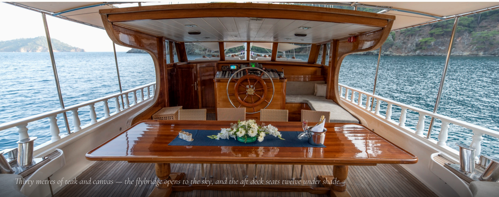
Thirty metres of teak and canvas — the flybridge opens to the sky, and the aft deck seats twelve under shade.

Below deck, the layout mirrors the fleet standard: two masters, two doubles, two twins, each with en-suite bathrooms and climate control. Above, teak decking runs fore and aft, with dining under the tente and a flybridge that opens out to the sky.