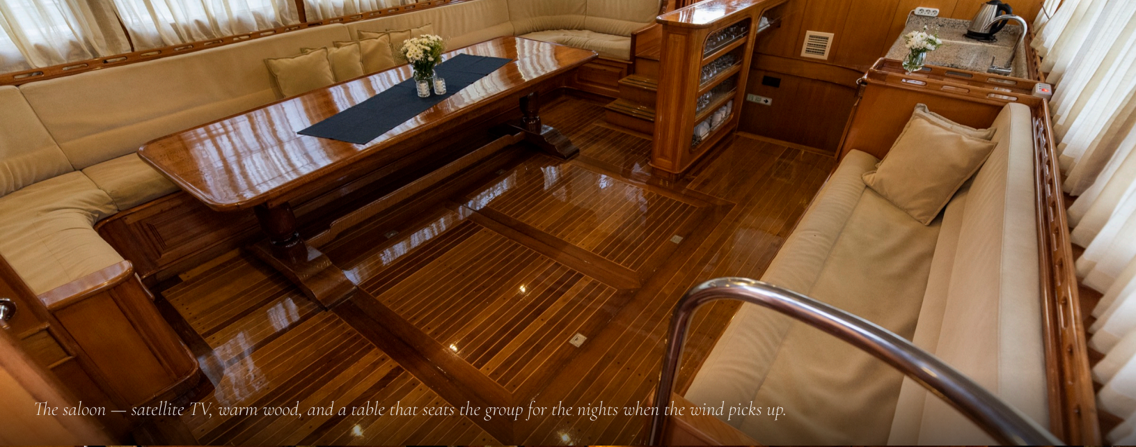
The saloon — satellite TV, warm wood, and a table that seats the group for the nights when the wind picks up.