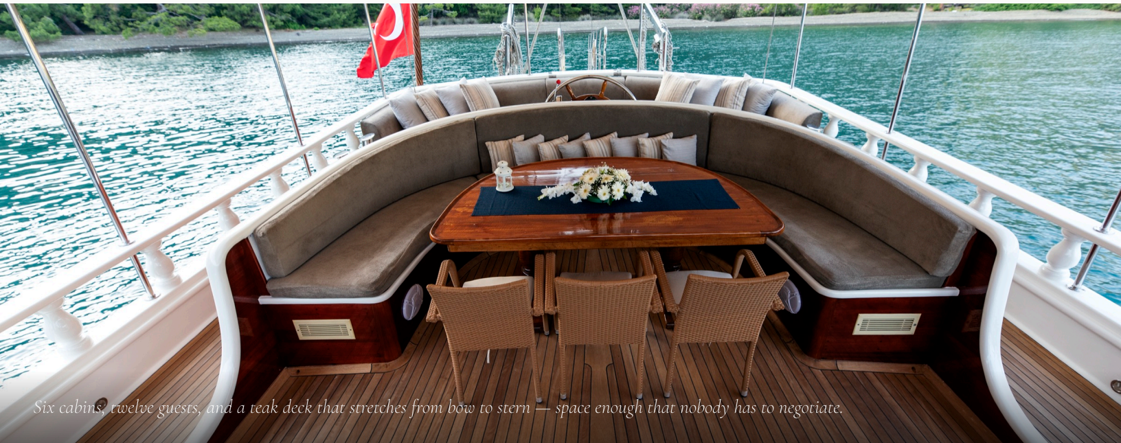
Six cabins, twelve guests, and a teak deck that stretches from bow to stern — space enough that nobody has to negotiate.

She carries a water maker, a dishwasher, and a joystick rudder system that makes anchoring in tight bays more precise than you'd expect from a traditional ketch. Roller sails go up when the wind is right. The rest of the time, a 450 HP IVECO keeps things moving.