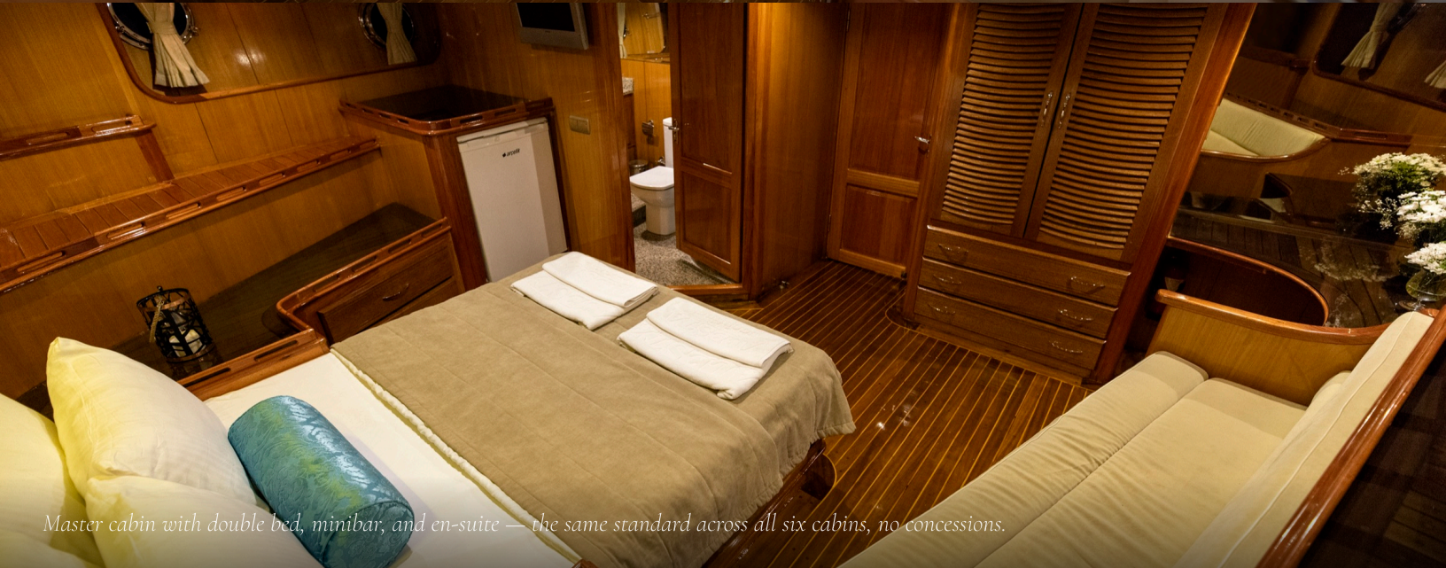
Master cabin with double bed, minibar, and en-suite — the same standard across all six cabins, no concessions.