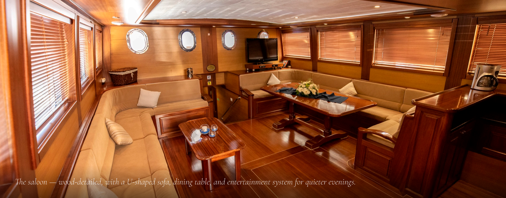
The saloon — wood-detailed, with a U-shaped sofa, dining table, and entertainment system for quieter evenings.