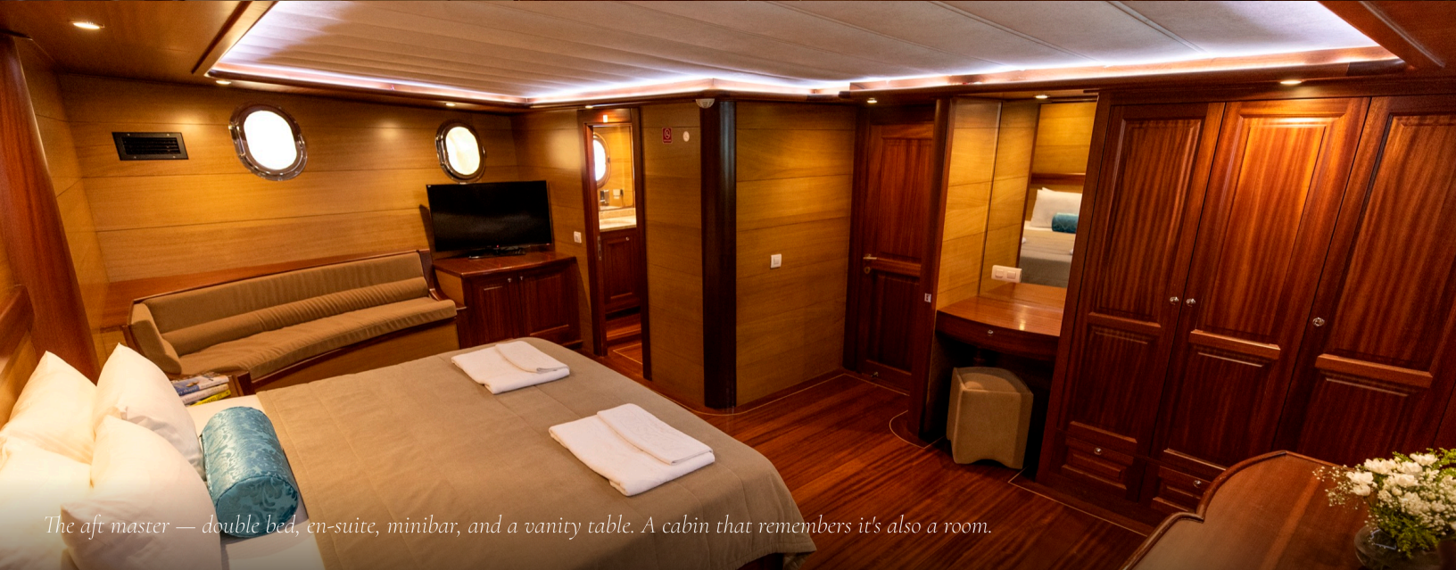
The aft master — double bed, en-suite, minibar, and a vanity table. A cabin that remembers it's also a room.