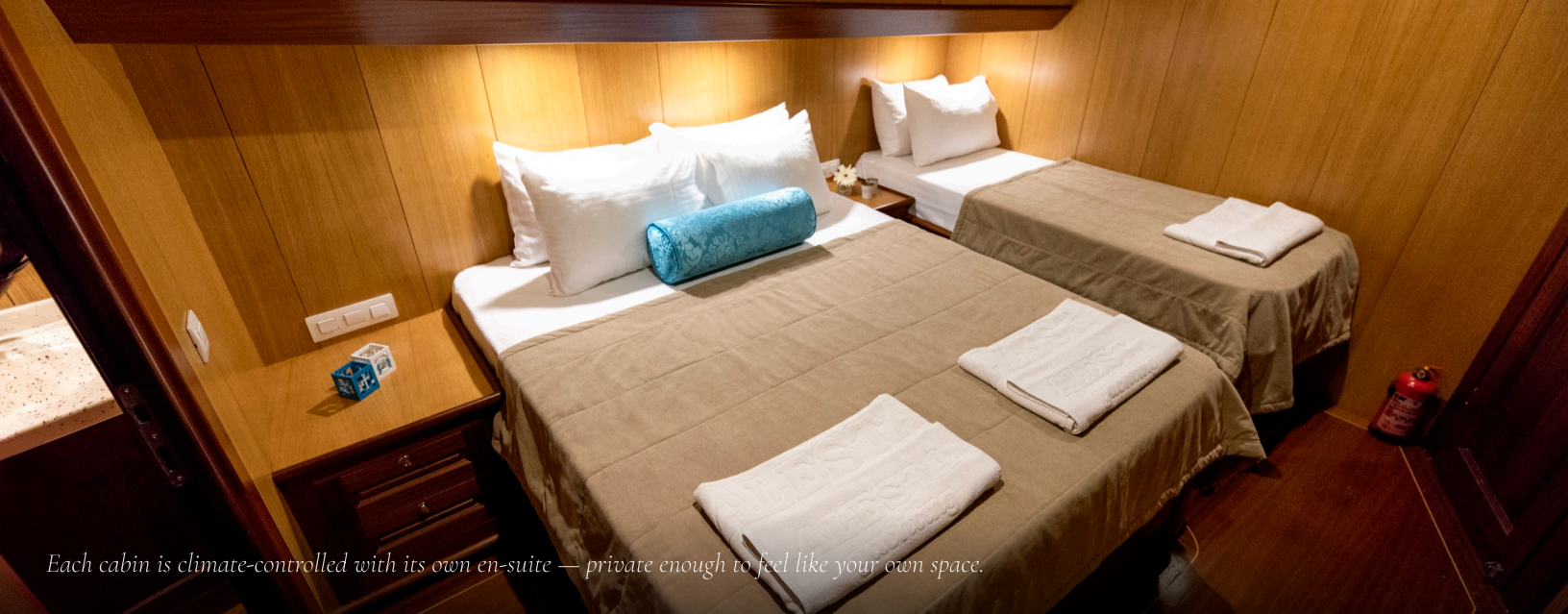
Each cabin is climate-controlled with its own en-suite — private enough to feel like your own space.