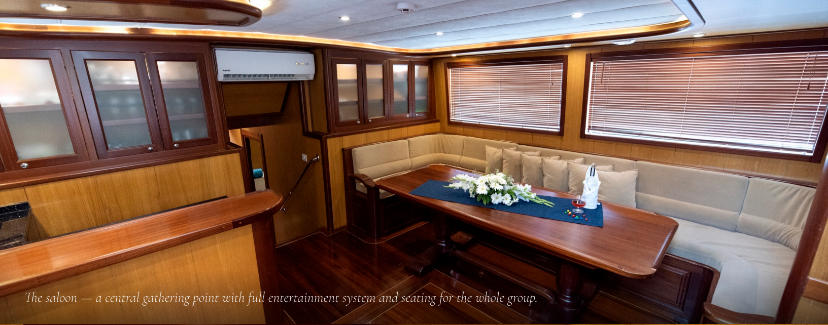
The saloon — a central gathering point with full entertainment system and seating for the whole group.