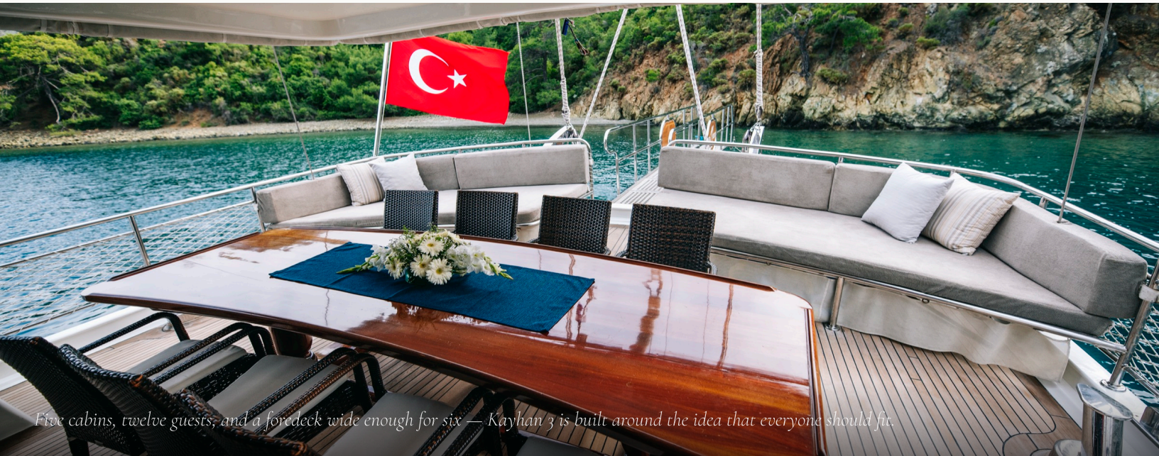
Five cabins, twelve guests, and a foredeck wide enough for six — Kayhan 3 is built around the idea that everyone should fit.

On deck, a wide aft area seats everyone for meals under the tente, and the foredeck carries six sunbathing cushions for the afternoons when nobody wants to talk. A crew of four handles everything — from anchoring in quiet coves to setting the table.