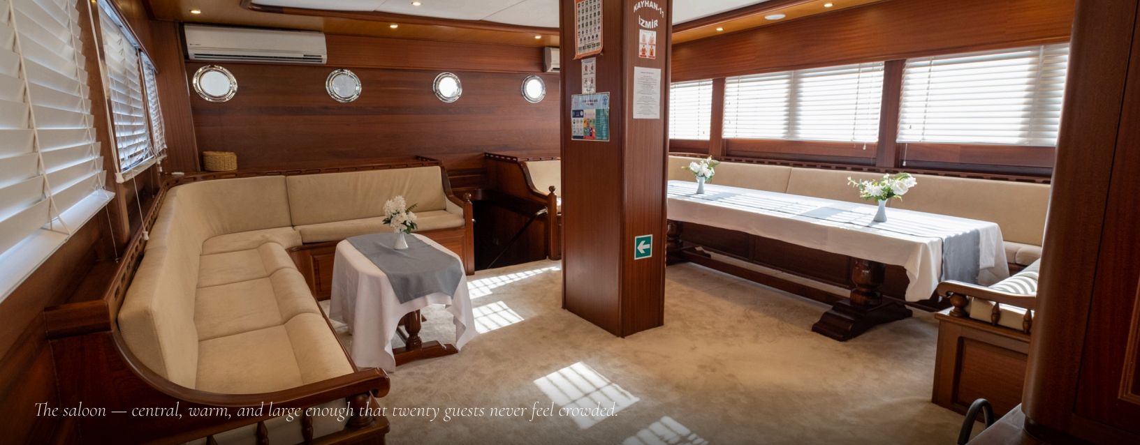
The saloon — central, warm, and large enough that twenty guests never feel crowded.