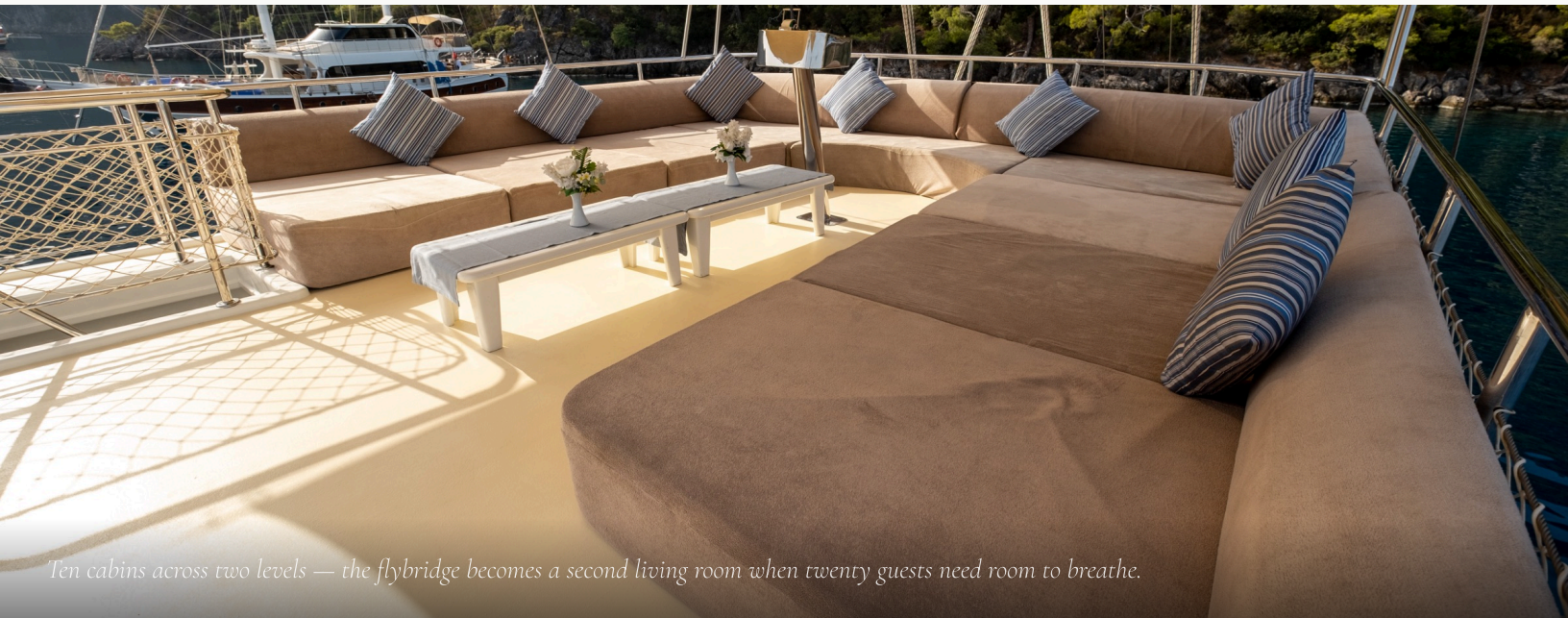
Ten cabins across two levels — the flybridge becomes a second living room when twenty guests need room to breathe.

Above deck, the space matches the scale: a wide aft dining area under a full tente, a flybridge, and a foredeck with enough room for everyone to find their own place. She carries 20,000 litres of water and a water maker — the kind of reserves that let you stay out longer and stop less often.