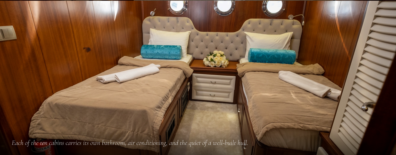
Each of the ten cabins carries its own bathroom, air conditioning, and the quiet of a well-built hull.