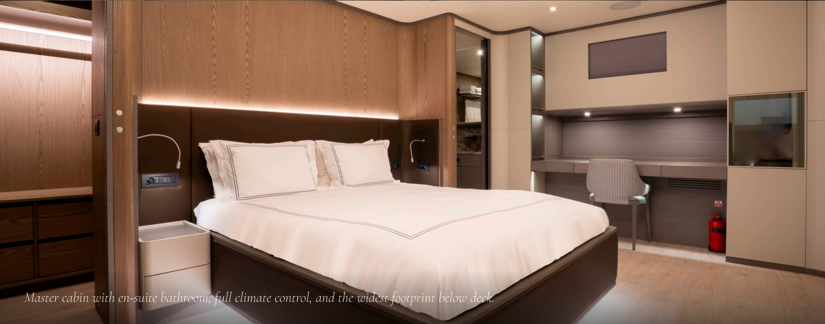
Master cabin with en-suite bathroom, full climate control, and the widest footprint below deck.