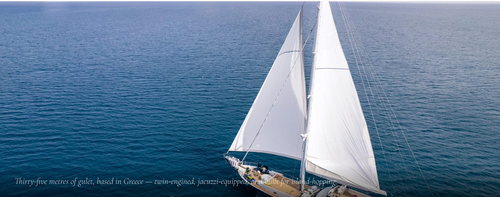
Thirty-five metres of gulet, based in Greece — twin-engined, jacuzzi-equipped, and built for island-hopping.

A crew of six runs everything with the kind of ease that makes the days feel unplanned — even when they aren't. Twin 610 HP engines give her the range to move between islands without lingering at fuel docks.