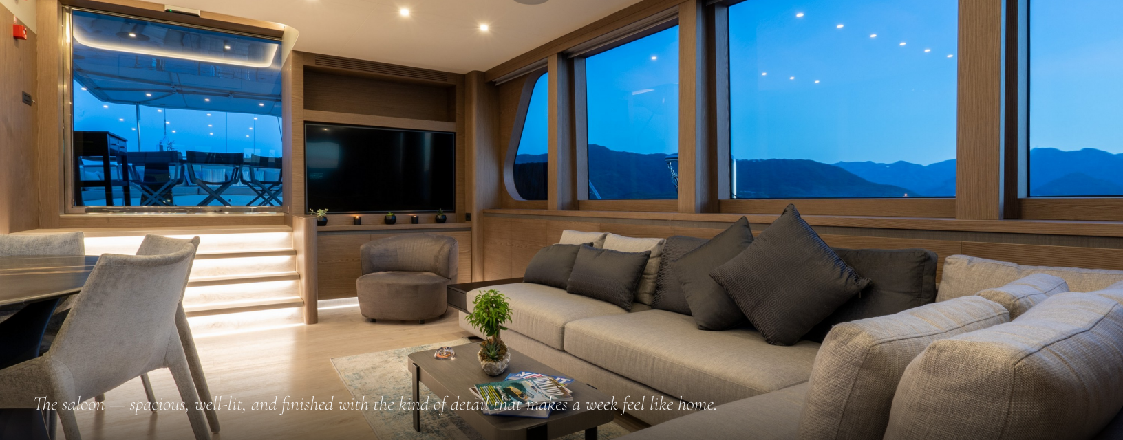
The saloon — spacious, well-lit, and finished with the kind of detail that makes a week feel like home.