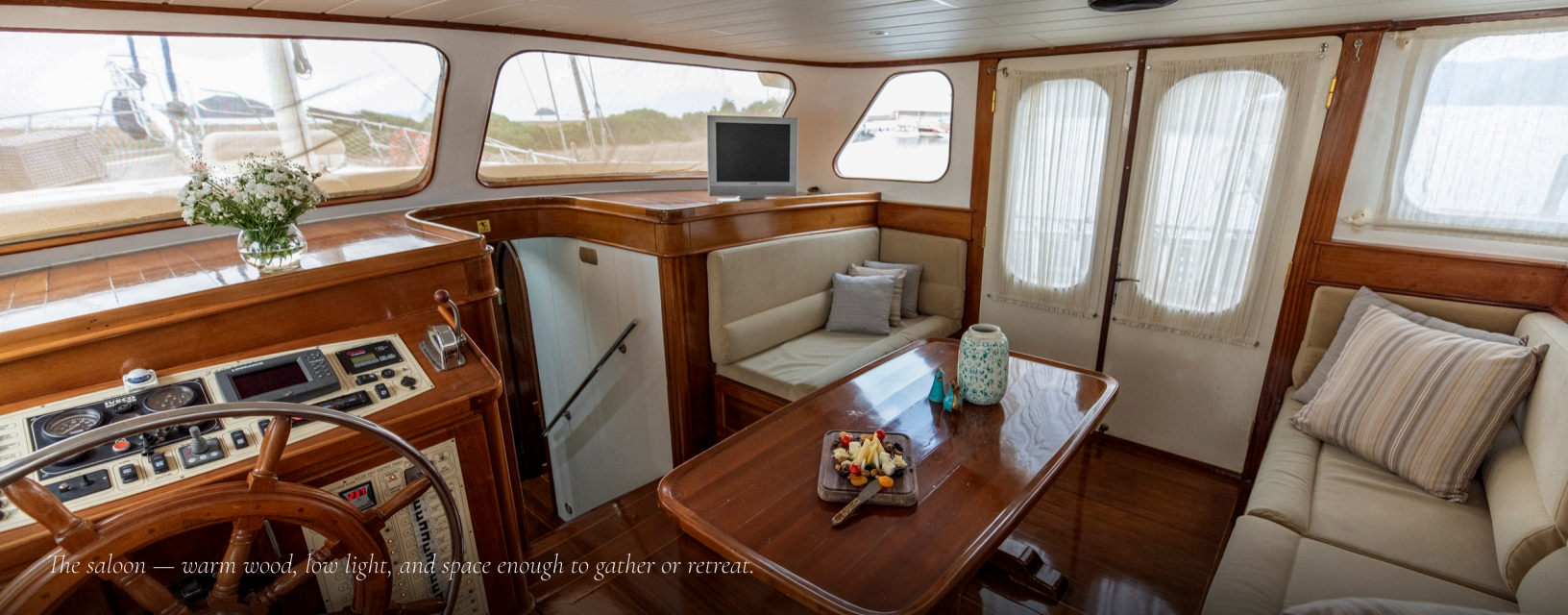
The saloon — warm wood, low light, and space enough to gather or retreat.