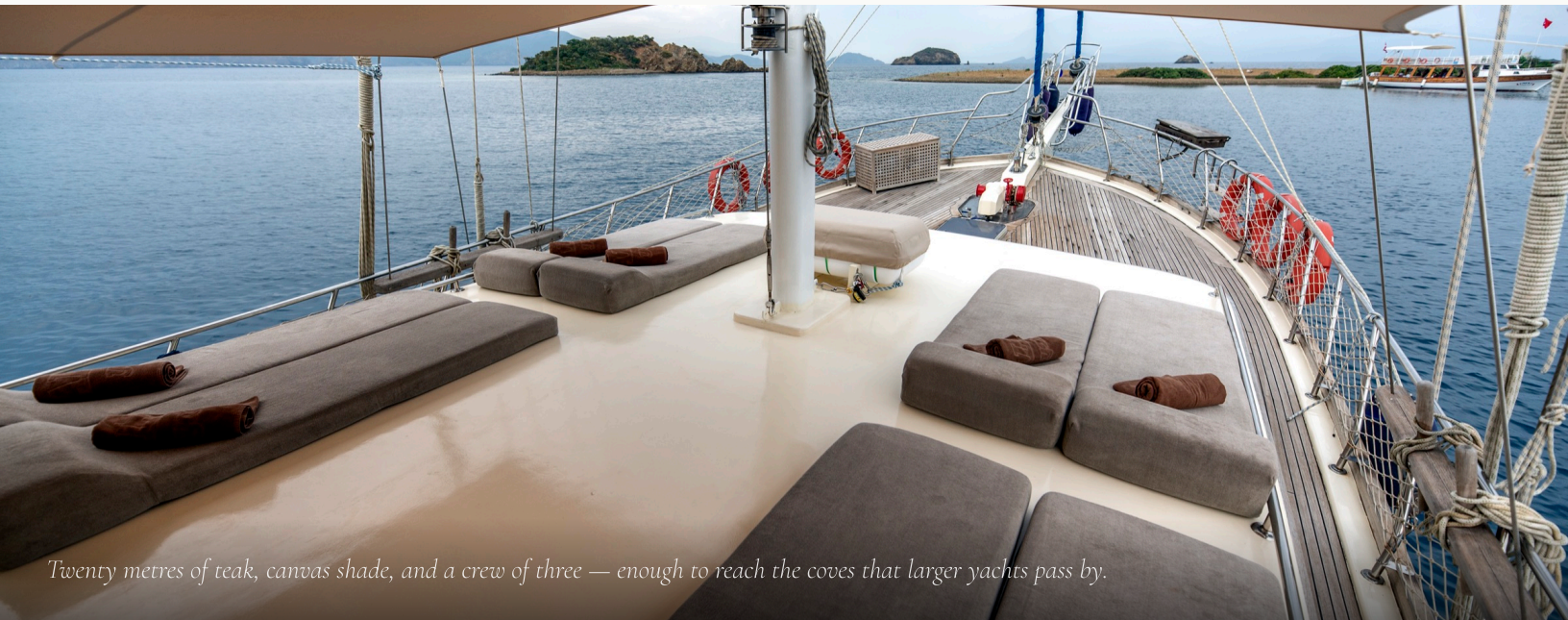
Twenty metres of teak, canvas shade, and a crew of three — enough to reach the coves that larger yachts pass by.

Below, the saloon is warm and finished in wood — a place that feels considered rather than decorated. Roller sails keep her moving under canvas when conditions allow. She's not trying to be the biggest thing in the bay. That's the point.