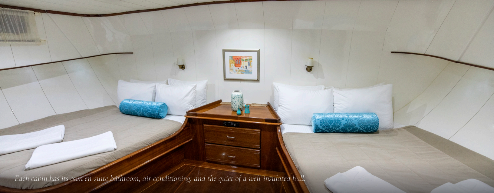
Each cabin has its own en-suite bathroom, air conditioning, and the quiet of a well-insulated hull.