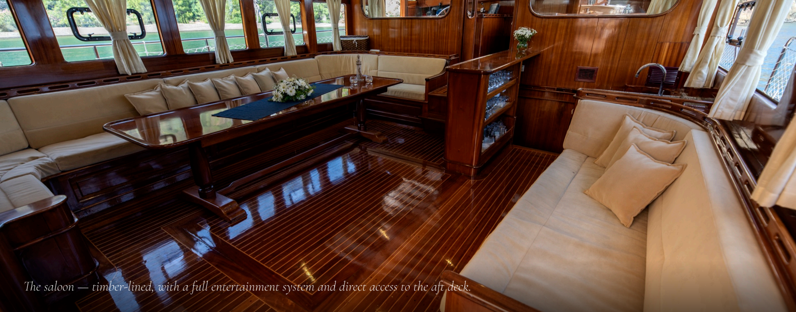
The saloon — timber-lined, with a full entertainment system and direct access to the aft deck.