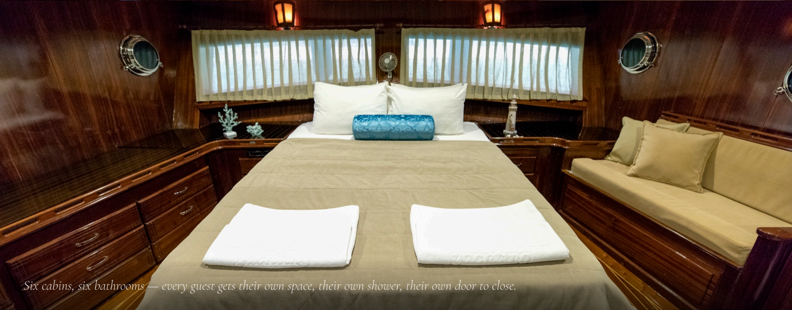
Six cabins, six bathrooms — every guest gets their own space, their own shower, their own door to close.