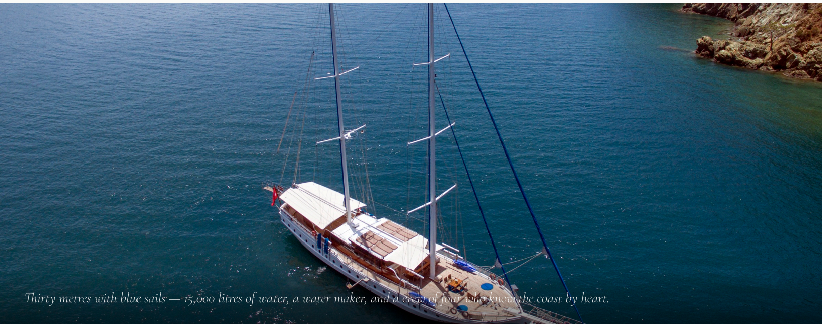
Thirty metres with blue sails — 15,000 litres of water, a water maker, and a crew of four who know the coast by heart.

On deck, the aft dining area seats everyone, and the saloon opens directly to it. A joystick rudder system gives the captain precise control in tight anchorages. Below, the interiors are warm and timber-lined, with a telephone system connecting cabins — a small detail that says something about how the boat was thought through.