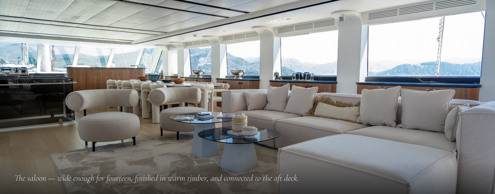
The saloon — wide enough for fourteen, finished in warm timber, and connected to the aft deck.