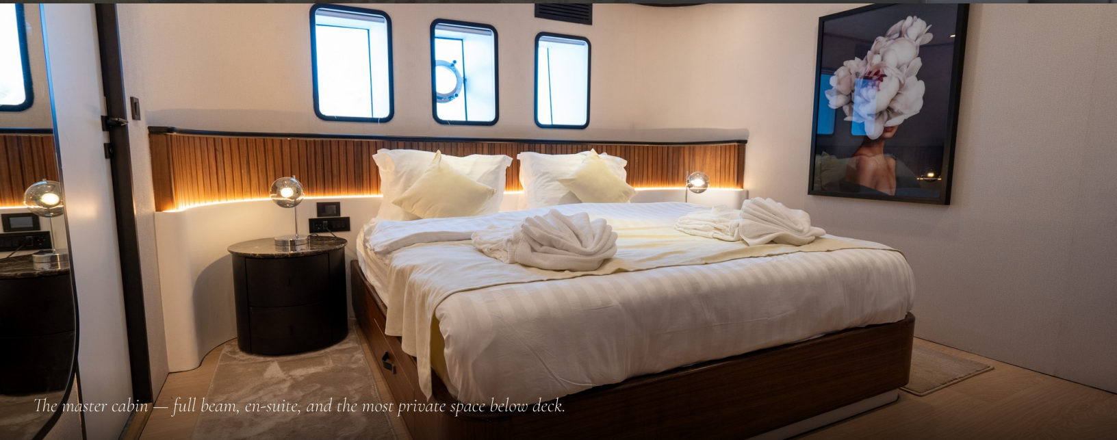
The master cabin — full beam, en-suite, and the most private space below deck.