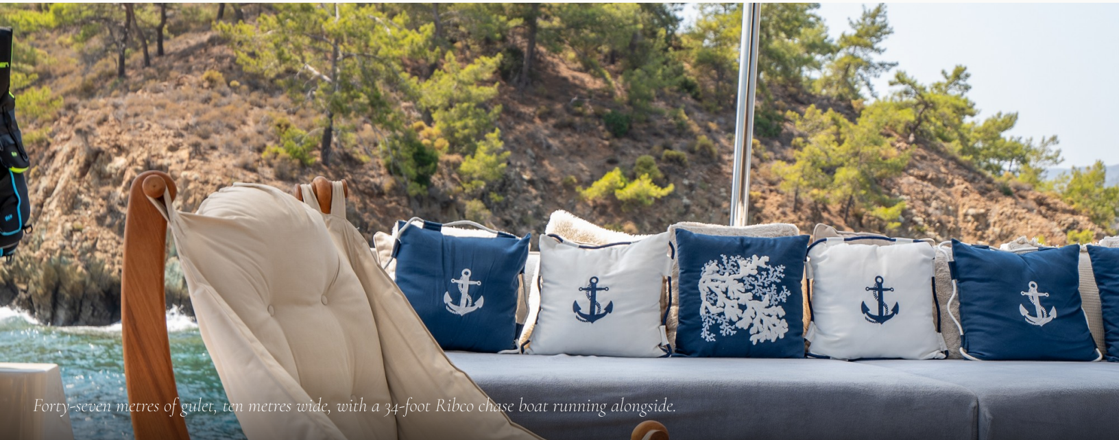
Forty-seven metres of gulet, ten metres wide, with a 34-foot Ribco chase boat running alongside.

A crew of ten — the joint-largest in the fleet — handles everything from the galley to the toy garage: two jet skis, a Waydoo Seabob, water ski, wakeboard, SUP, kayak, a four-seat Big Mable, ringo, and an E-foil available on request. Twin 750 HP Volvo engines give her the power to reposition quickly between destinations.