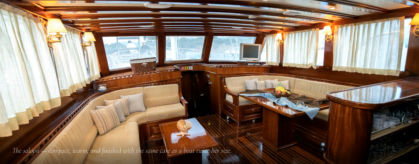
The saloon — compact, warm, and finished with the same care as a boat twice her size.