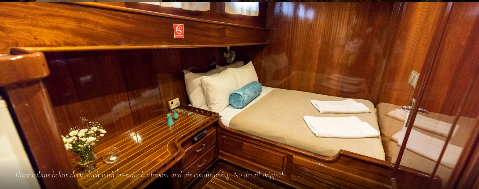
Three cabins below deck, each with en-suite bathroom and air conditioning. No detail skipped.