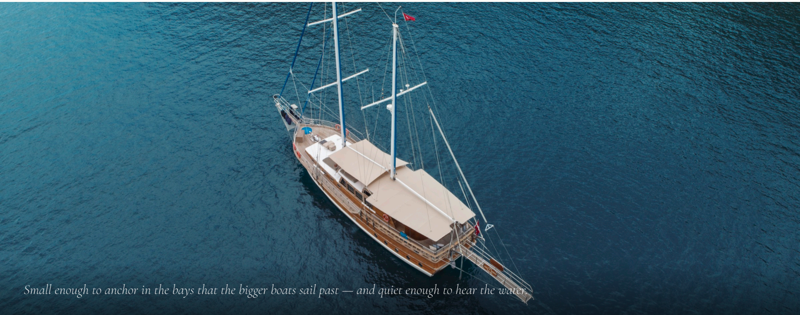
Small enough to anchor in the bays that the bigger boats sail past — and quiet enough to hear the water.

A crew of three handles everything — navigation, cooking, anchoring — with the kind of quiet attention that comes from knowing this coastline season after season.