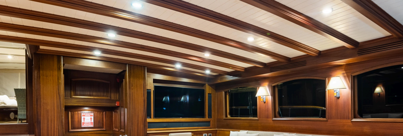
Mahogany panelling throughout — the saloon seats twelve and opens directly to the aft dining area.