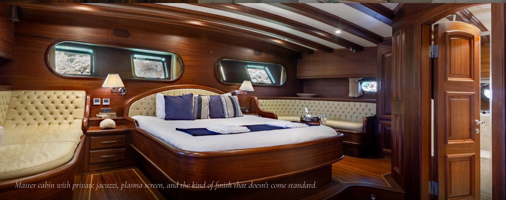
Master cabin with private jacuzzi, plasma screen, and the kind of finish that doesn't come standard.