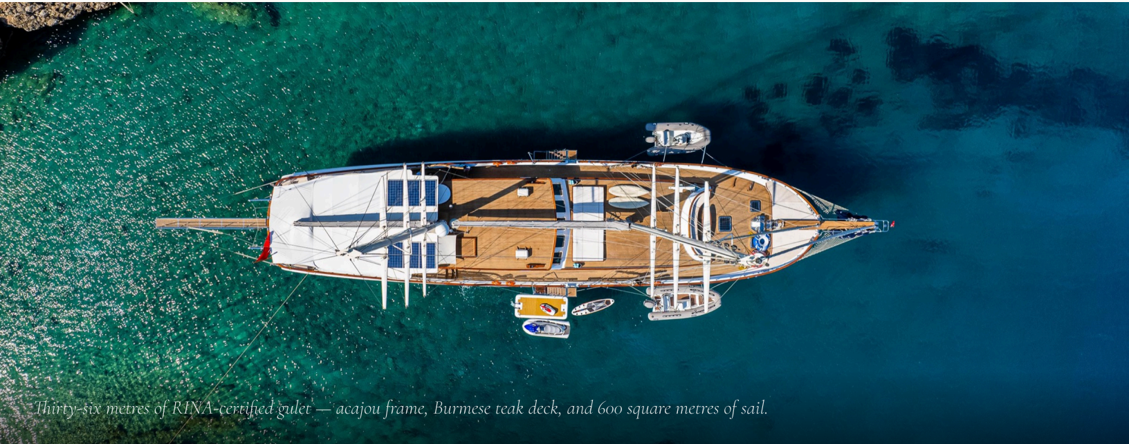
Thirty-six metres of RINA-certified gulet — acajou frame, Burmese teak deck, and 600 square metres of sail.

A crew of six runs everything — captain, chef, and four sailors who know the coast well enough to suggest the anchorage you didn't know about. Twin 500 HP Iveco engines and 600 square metres of sail give Caner IV the range to cover serious distance when the wind is right, and the power to move when it isn't.