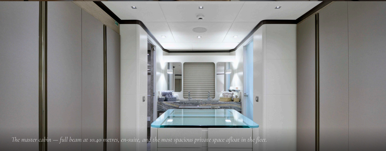
The master cabin — full beam at 10.40 metres, en-suite, and the most spacious private space afloat in the fleet.