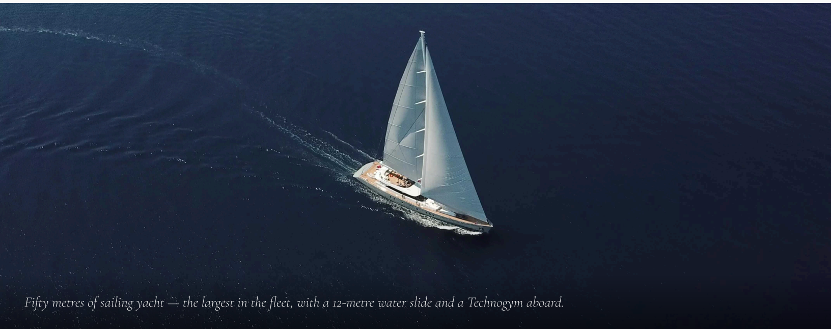
Fifty metres of sailing yacht — the largest in the fleet, with a 12-metre water slide and a Technogym aboard.

A crew of ten — the joint-largest in the fleet — runs everything with the kind of precision that lets twelve guests feel like they're the only people on the water. Three sets of water skis, two wakeboards, SUPs, kayaks, a ringo, a floating parking platform, and snorkelling gear complete the picture.