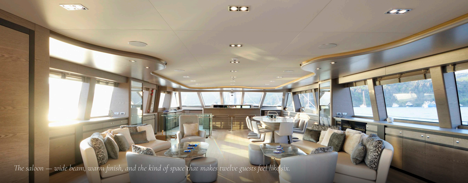
The saloon — wide beam, warm finish, and the kind of space that makes twelve guests feel like six.